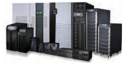
Delta offers a full range of UPS solutions from 600 VA to 4000 kVA to fulfill your power security needs.

HPH-B: UPS integrated battery model has batteries inside