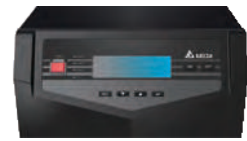
Control and LCD Display Panel