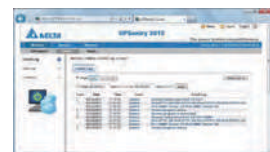
Advanced UPS Management Software - UPSentry 2012